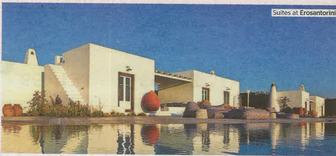
Suites at Erosantorini